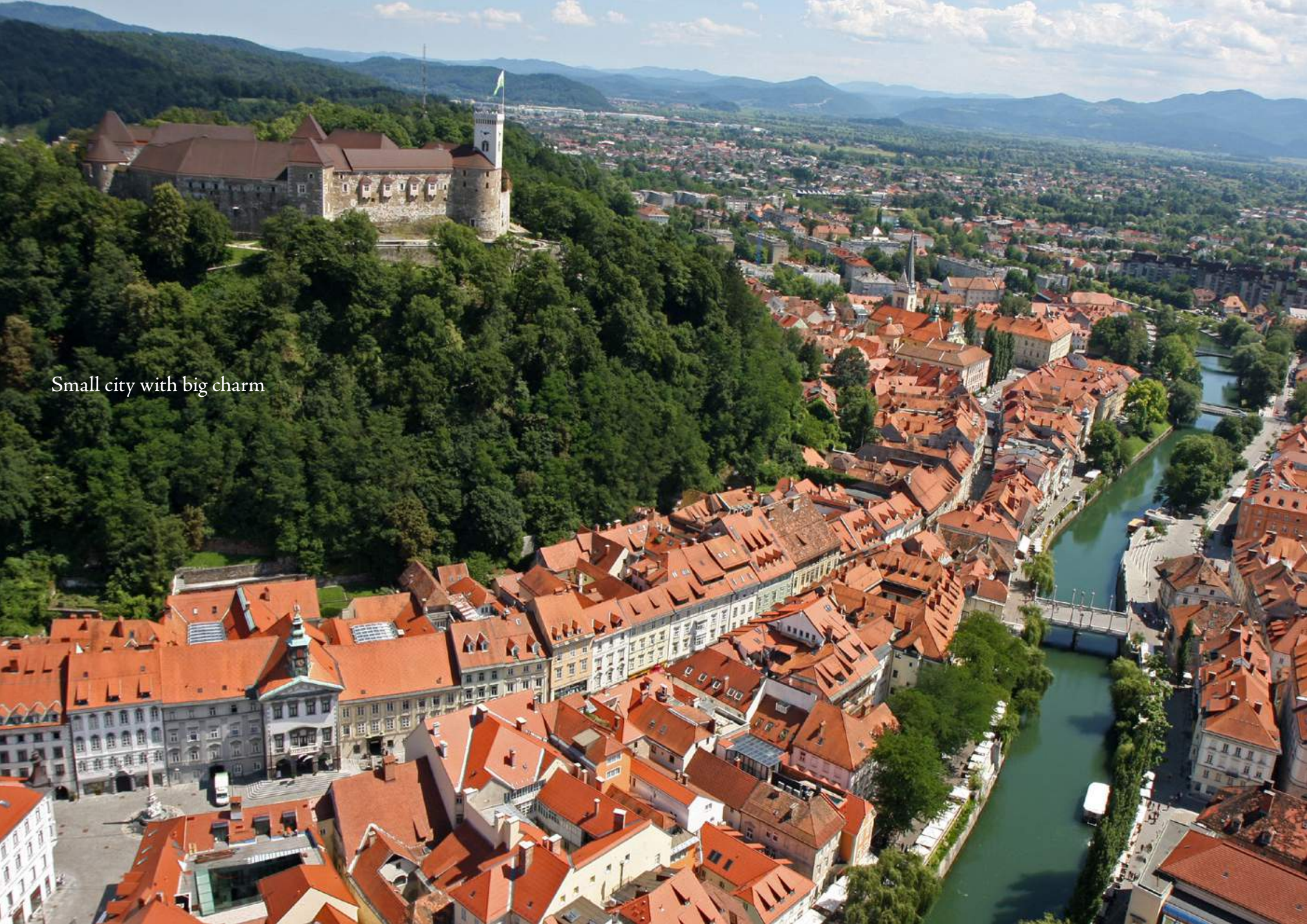
Small city with big charm